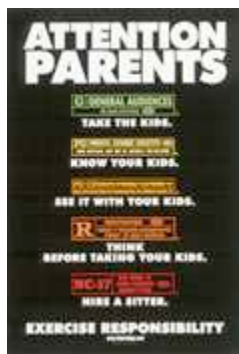
___ B. Attention Parents