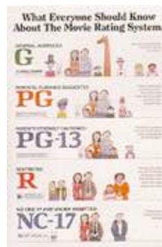
___ E. Classic