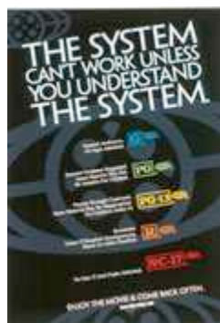
___ D. The System