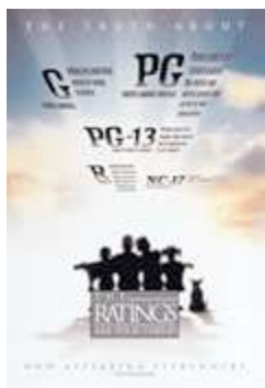
___ A. The Truth About

Indicate quantities for each poster, fill out the rest of the form, and return it to the address at the bottom.