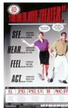
___ C. It Came From...